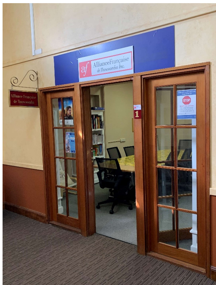
Alliance Française de Toowoomba Office, 2021.

The Alliance has always recognised the importance of having French resources available to its members. In the early years, the resources were shared with schools for use by students of French. As the library grew it received its own dedicated section at the municipal library, where resources could be shared with the broader community. Since 2011, it has been housed at the Alliance premises at 217 Margaret Street, Toowoomba. In 2020, Alliance members gained free access to Culturethèque an e-library where resources are available via streaming or downloading.