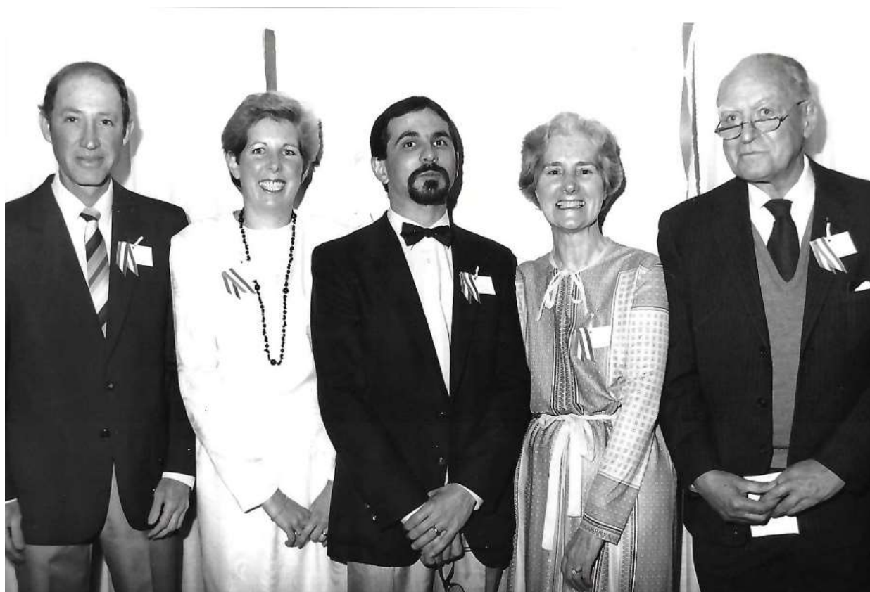
Celebrating La Fête Nationale in 1986 at the Gold Pack Sports Club.

dinners. A variety of Toowoomba venues were used and some of these are the Alliance Room, Kensington Restaurant, Chrissy's Restaurant, Herries House, Karingal Café, the Cathedral Centre, Alpenhof Restaurant and Gold Park Sports Club. It was not unusual for events to be held outside Toowoomba. In 1996, La Fête Nationale was celebrated at La Goulue French Restaurant, Hatton Vale and on many occasions Alliance members generously opened their own homes for the celebration.