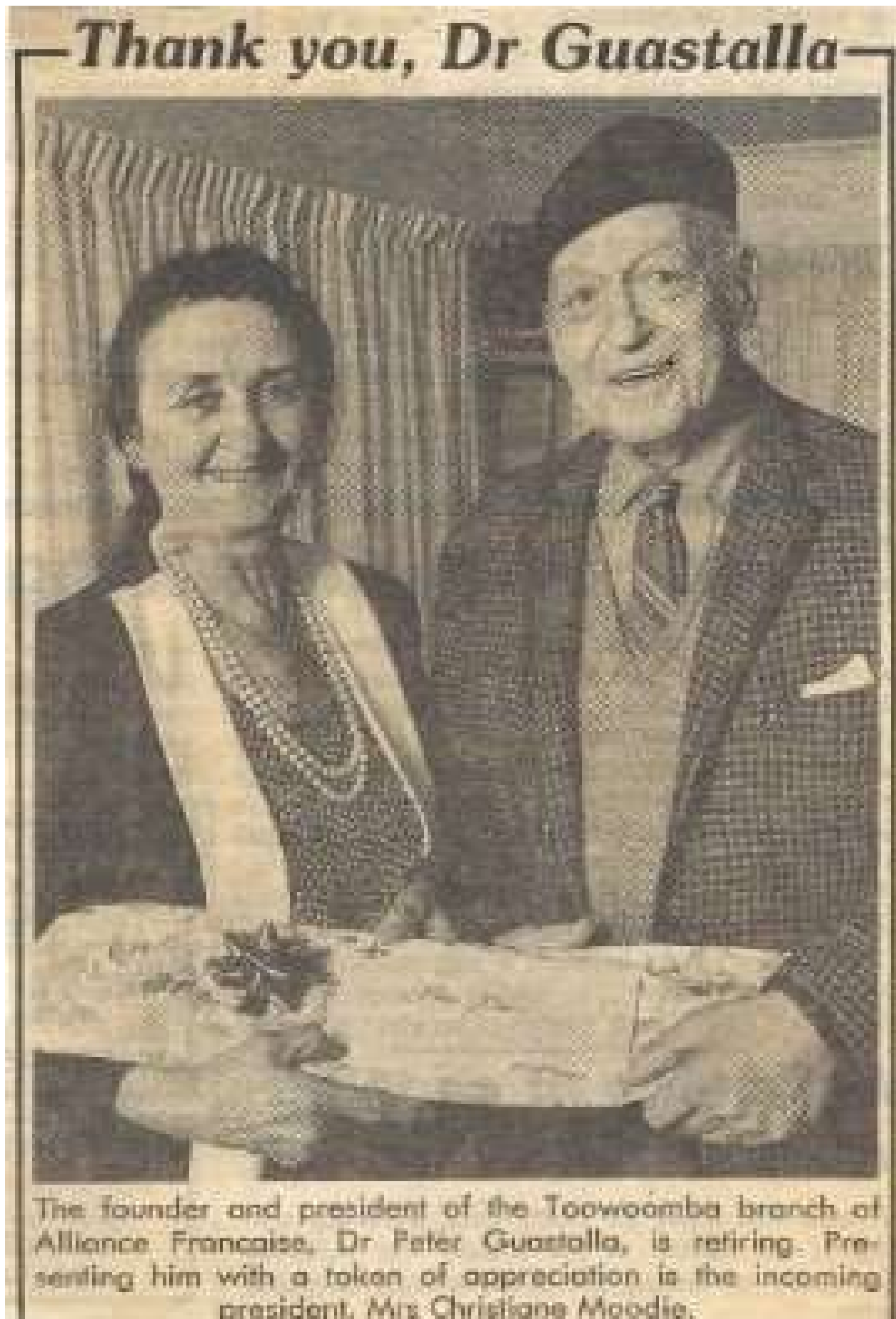
The Chronicle, Toowoomba, 31 May 1990